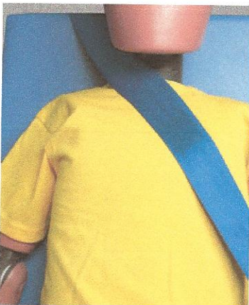
Poor shoulder belt fit